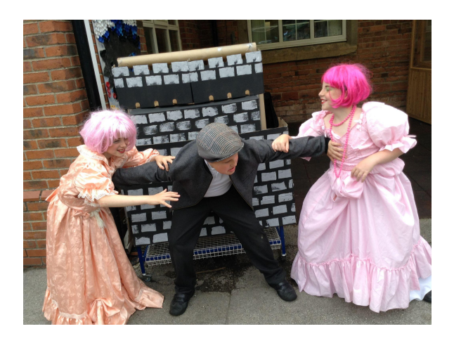
Photographs from our fantastic Leavers' Performance - Cohenella!